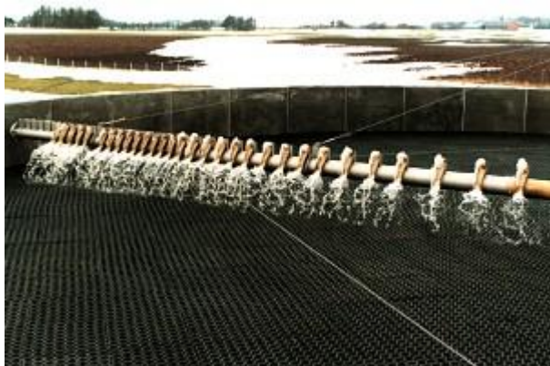
Photo 2: Rotating arms spreading the waste water - Hjørring Renseanlæg (treatment plant)

The spreading of the waste water over the filter medium can also take place through fixed spreaders. Thus the pressure loss is avoided and the system becomes more energy friendly. By using fixed spreaders, it is also possible to construct trickling filters in rectangular tanks. Thus the system becomes more flexible and thus cheaper to run and establish.